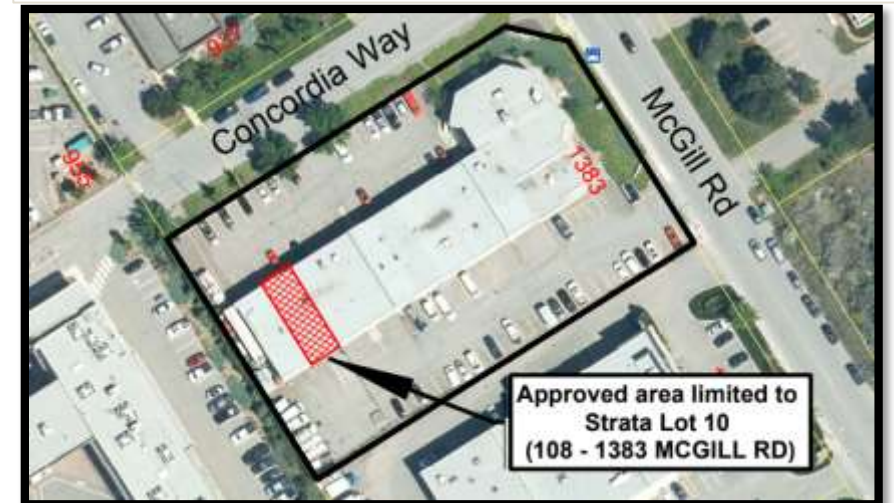
Below: Micro Processing Site in the City of Kamloops