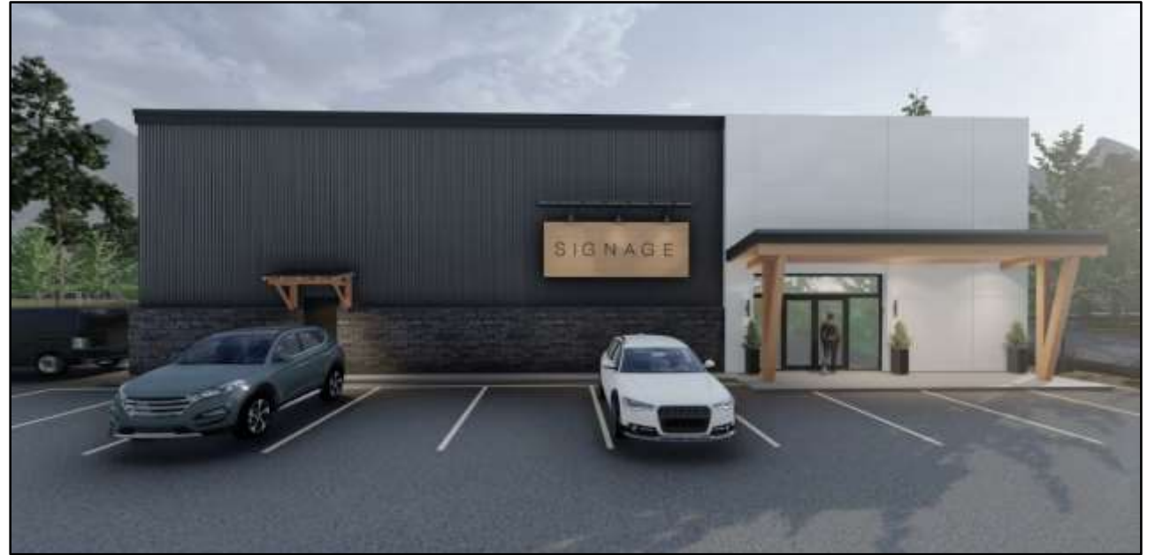
Conceptual renderings of a micro cultivation facility