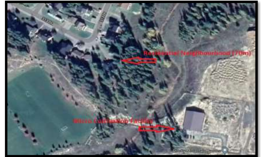
Above: Micro Cultivation Site in the City of Kimberley

Example 2: In 2021 a Temporary Use Permit was approved in the city of Kamloops to allow for Micro Processing of Cannabis within an existing light industrial park. Adjacent units in the same building provided feedback that noise and odour were not an issue.